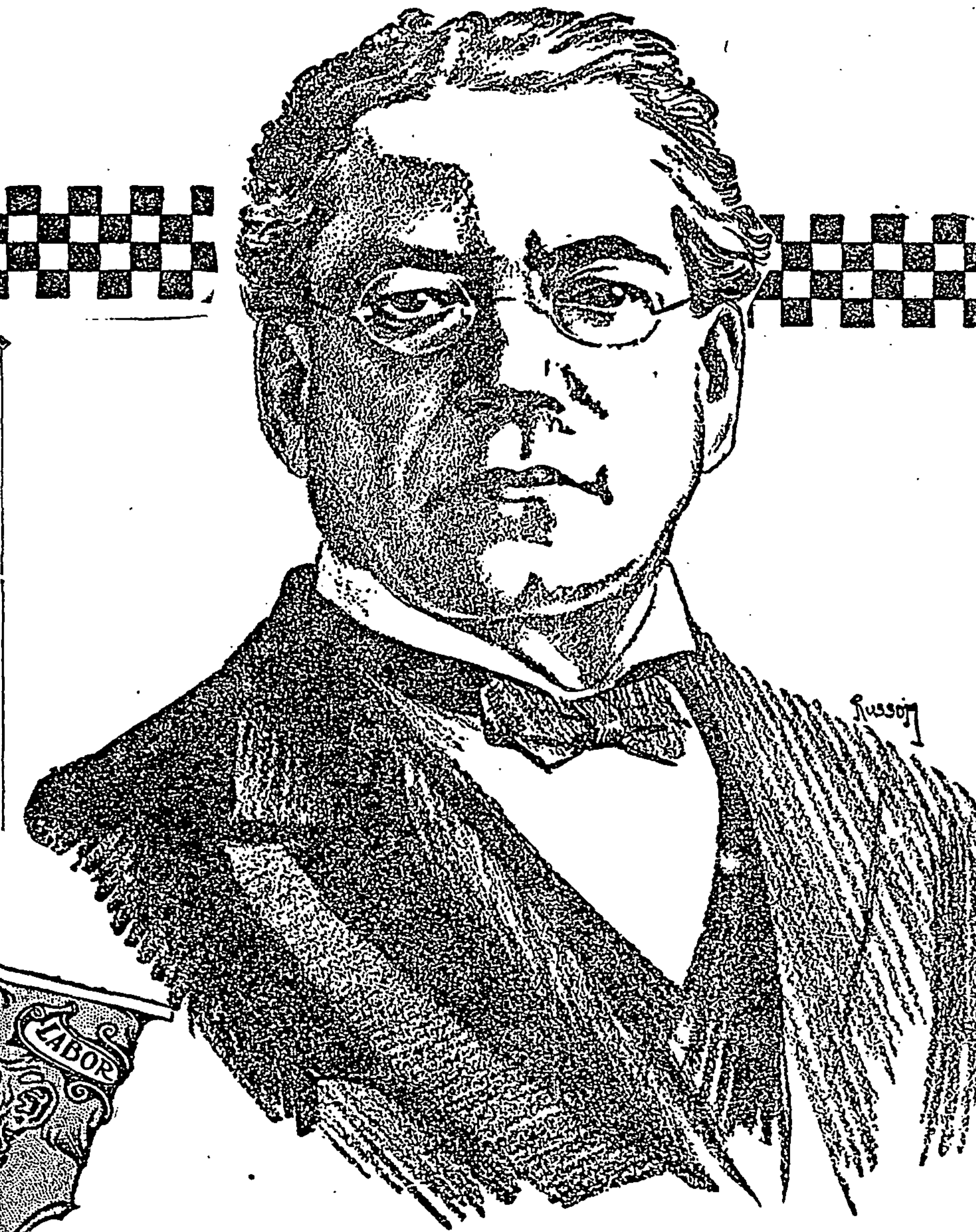
Samuel Gompers, President of the Federation of Labor.

unnecessarily cruel environments. The struggle is for home and fireside, for a higher life, a nobler manhood, womanhood, and childhood, which may look forward to the day of deliverance from absurd economic conditions and cruel burdens. The future will substitute the college and forum for the arsenal and jail; the home, and not the factory, for motherhood; the playground, school, and sunlight, and not the mill or workshop, for childhood.