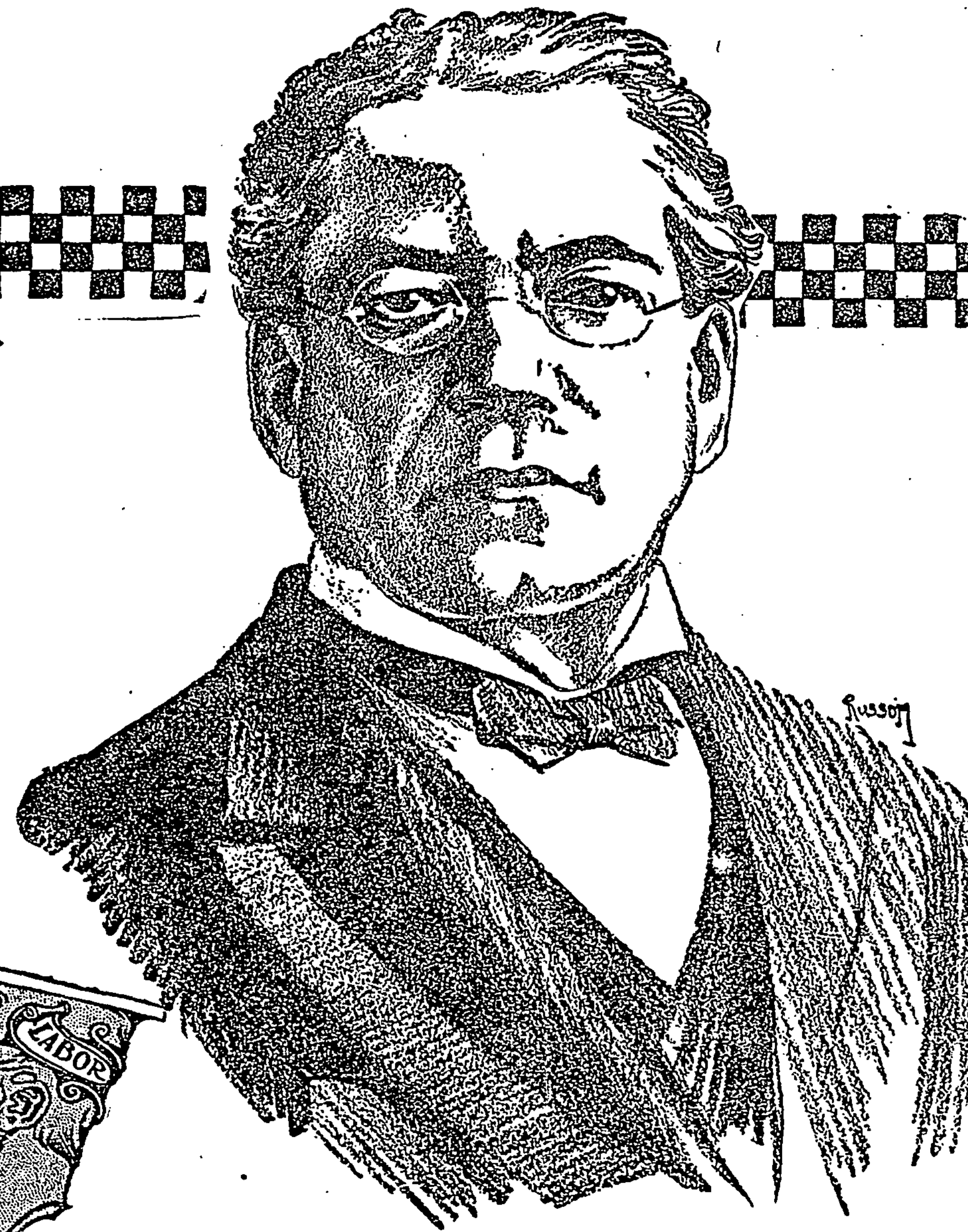
Samuel Gompers, President of the Federation of Labor.

unnecessarily cruel environments. The struggle is for home and fireside, for a higher life, a nobler manhood, womanhood, and childhood, which may look forward to the day of deliverance from absurd economic conditions and cruel burdens. The future will substitute the college and forum for the arsenal and jail; the home, and not the factory, for motherhood; the playground, school, and sunlight, and not the mill or workshop, for childhood.